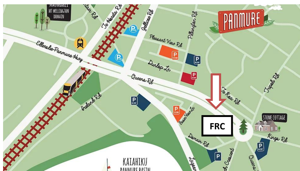
Map courtesy of Pop Into Panmure

Parking: There are free public car parks in Panmure and street parking at the front door of the FRC which is subject to time restrictions. Further information can be found at Pop Into Panmure .